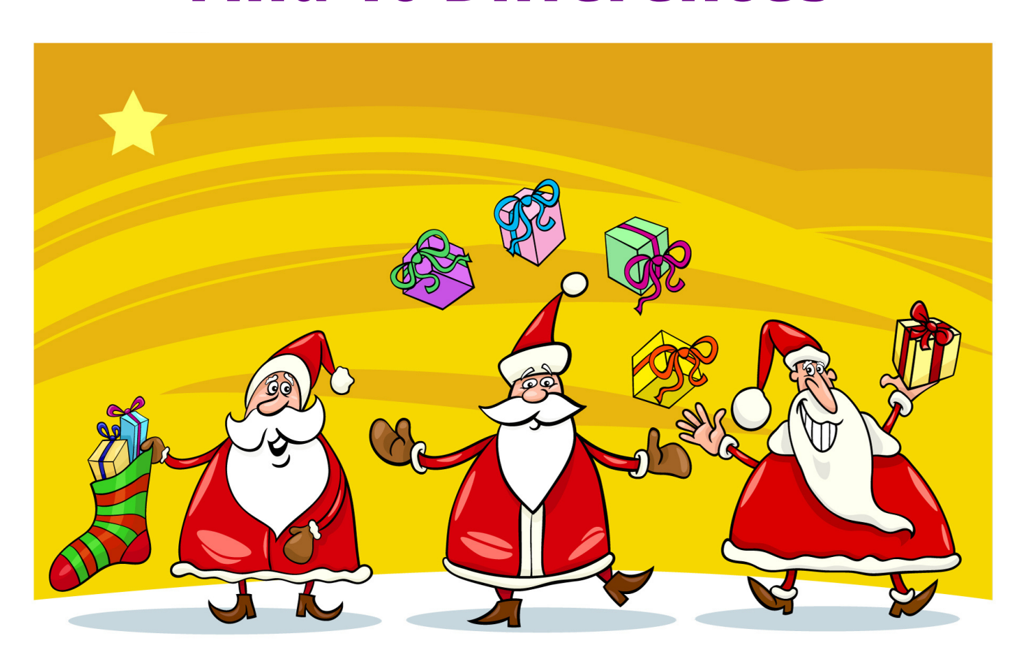
Draw a circle around the differences